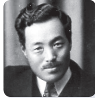
Dr. Hideyo Noguchi

The cause of all illnesses begins with a lack of oxygen(Hypoxia).