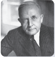
Dr. Otto Warburg

Cancer is caused by a lack of oxygen requirements.