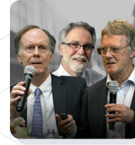
Dr. Gregg L. Semenza (Prof. Johns Hopkins University of medicine)